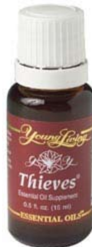
Thieves Essential Oil #3423 $29.50

Medicine Wheel Consultants, Inc. 306 S. Lookout Mtn. Rd., Suite B Golden, CO 80401