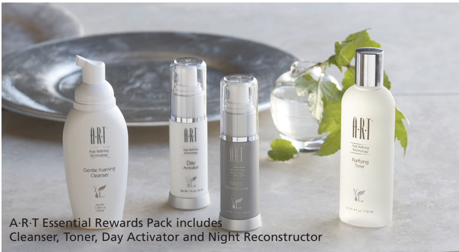
A-R-T Essential Rewards Pack includes Cleanser, Toner, Day Activator and Night Reconstructor

Vitamin C is combined with Matrixyl, to produce a 50% greater increase in skin matrix regeneration than the Peptide Complex alone. 2