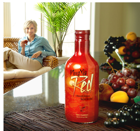
NingXia Red Juice is #1 in Antioxidants 1 oz NingXia Red = 8 bottles XanGo™

One enzyme blend - Allerzyme™ - was formulated specifically for allergy sufferers. Allerzyme is a vegetable enzyme complex which helps to combat allergies, gas, fermentation, fatigue and irritable bowel syndrome (IBS). It contains a powerful combination of sugar and starch-splitting enzymes as well as a small amount of fat and protein digesting enzymes. Other YL enzyme formulas offer extra support for digestion of proteins, fats, carbohydrates and for internal detoxification.