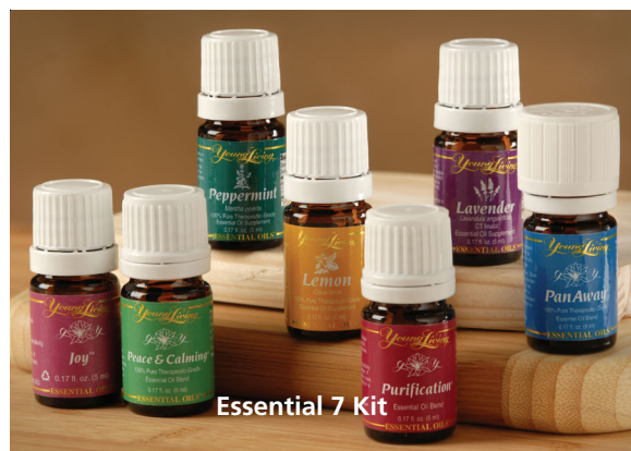
Essential 7 Kit