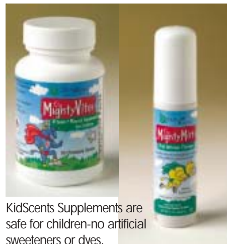
KidScents Supplements are safe for children-no artificial sweeteners or dyes.

chew pills can just spray Mighty Mist inside their mouths for a nutrient infusion. This multivitamin, multimineral and amino acid supplement includes wolfberry polysaccharides for a strong immune system.