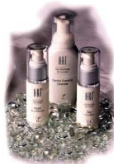
ART Skin Care System Rejuvenate Your Skin

Below are some of my family's favorite products that we use every morning. These are great ideas for your first Autoship order .