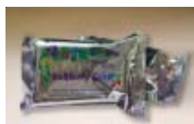
Wolfberry Crisp Bars for delicious nutrition on the go!