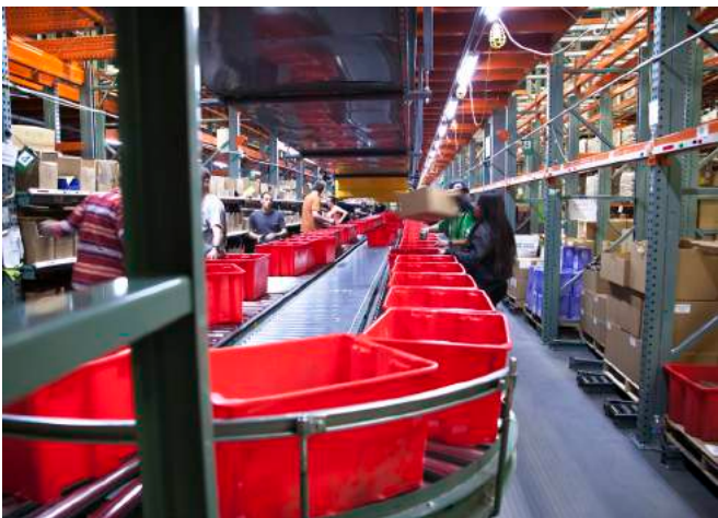
Our Spanish Fork, Utah, Warehouse Pick Line.

Everybody's curious about what it takes for their favorite Young Living single oils and blends to arrive at their door. Learning about the process of getting an oil from the distillery to your home will give you a greater understanding of the journey each product takes. After the distillation of a botanical at one of our farms or partner farms, the essential oils are sent to our